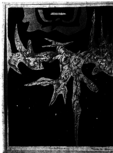
"ARCHETYPE," COLLAGE BY PONCE DE LEON