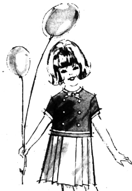
Reg. 5.98-8.98 Girls' Summer Dresses 4 88

Darling new-season cotton and dacron sheer dresses in A-line and bouffant skirt styles, bright solids, or prints. Sizes 7-14.