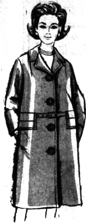
Rain 'n' Shine Coats... Junior and Misses Sizes 10 90

Sketched is just one style from a newly arrived collection of coats with many new style features. In beige, black, navy, powder green, etc.