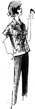
10.98-12.98 Slim Jim Cotton Sets 8 99

Flattering slim pants co-ordinated with matching shirt in lively prints and colors. You'll want several! 10-18.