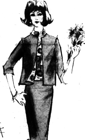
14.98-16.98 Bright Summer 3-Pc. Suits 9 88

Smart, trim looking suits with contrasting tops, in rayon/dacron blends, bright summer colors; sizes 10-16.