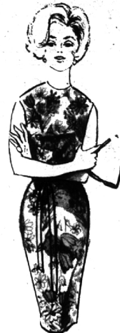
Reg. 11.98-14.98 Junior Spring Dresses 9 00

Light and feminine dotted swiss sleeveless sheath, just one from our chic collection of new dresses in whip creams, blends, etc. 5-16.