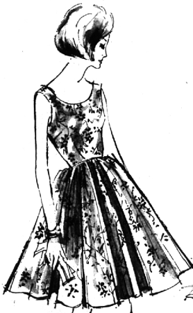
Reg. 6.98-7.98 Cool Sundresses 5 00

Daytime dresses in summer prints on white or dark backgrounds and solids. Polished and textured cotton fabrics. 8-16. (Some half-sizes available).