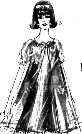
Special Purchase! Nylon Peignoir Sets 10 99

Floating, feminine nylon tricot peignoir sets, waltz length. In pastel shades of pink, blue, maize, white, some with lace appliques. S-M-L.