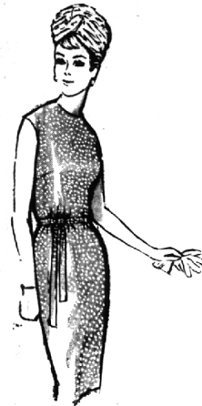
Reg. 11.98-14.98 Colorful Spring Dresses 9 00

Gracefully printed whipped cream slim sheath, in flattering soft colors. Other styles in cotton, blends, etc. Sizes 8-18.