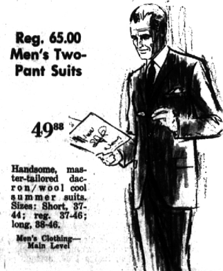
Reg. 65.00 Men's Two- Pant Suits 49 88

Handsome, master-tailored dacron/wool cool summer suits. Sizes: Short, 37-44; reg. 37-46; long, 38-46.