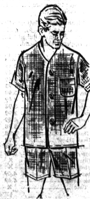
Reg. 4.25 Men's Knee- Length Pajamas 2 99

Comfortable, short-sleeved cotton knee-length pajamas in assorted patterns and colors, A, B, C, D.