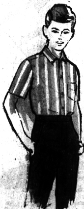
Reg. 2.98-3.98 Boy's Short Sleeve Sport Shirts 2 29

Famous - make 100% cotton sport shirts in assorted styles and colors. Sizes 6-20.