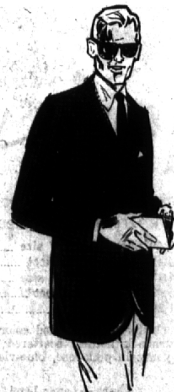
Reg. 29.95-32.95 Men's Sport Coats 24 88

Handsome, lightweight sport coats in wanted quality fabrics. Reg. long, 39-46.