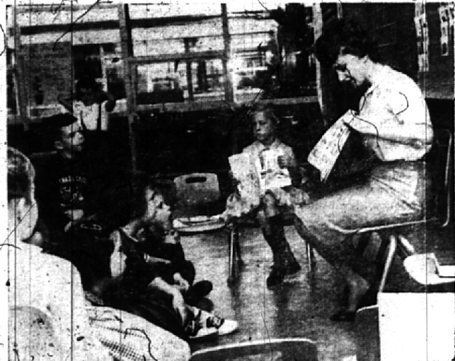
Transmitting the cultural heritage depends upon skills of communication.