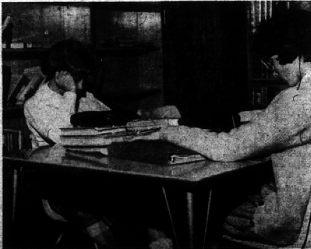
Books still remain the prime source from which we learn about our heritage.