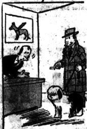
"I'd like to get a seeing eye dog for him!"