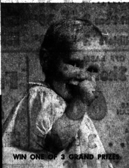
WIN ONE OF 3 GRAND PRIZES

bill williams studios, inc. 100 BROOKS RD. • ROYAL OAK PHONE 548 7660