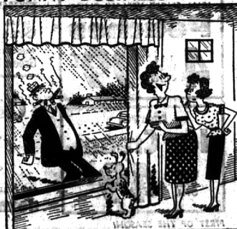
"Here comes dad—I guess he got his raincoat!"