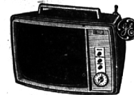
11" PERSONAL PORTABLE TV

Only 12 pounds light and a tremendous performer. You can carry this set with you anywhere and get the brightest, sharpest picture ever.