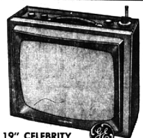
19" CELEBRITY PORTABLE TV

Here's a power transformer chassis and "blue-daylight" picture tube at a real blitz price. G.E. factory service tool.