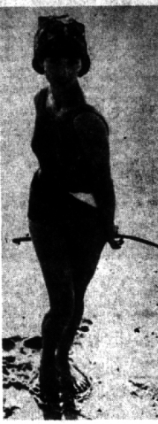
SWIM IN A SWEATER Fire engine red

Of those who both own and drive a car, the greatest percentage (61 per cent) are in the West; the smallest percentage in the Northeast.