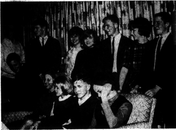
TEEN-AGE PARTY GOERS