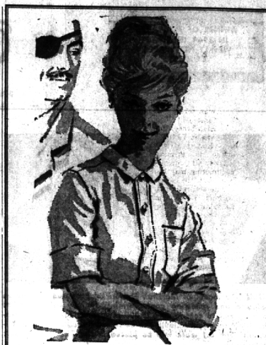
From Lady Hathaway—The man-tailored shirt with feminine differences