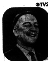
10:30 Garry Moore Comedian Allan Sherman, folk singer Miriam Makeba, singer Vicki Carr and the Hi-Lo's all join Garry for a real lively night.