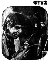
11:30 Morgus Presents: "The Haunted Strangler"—a distinguished novelist pursues the mystery of a man hung as a strangler twenty years ago.