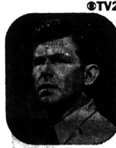
9:30 Andy Griffith Aunt Bee decides to economize by buying a side of beef, but trouble starts when the freezer breaks down.