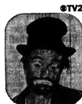
8:30 Red Skelton Rhonda Fleming and Hank Henry join Red for a riotous sketch entitled, "Captains Outrageous." Don't miss the fun.