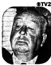
10:30 Alfred Hitchcock A woman becomes obsessed with jealousy and hate and commits strange insane acts.