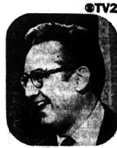
11:30 Steve Allen Singer Dennis Day, Cliff Arquette and Steve get together for a lesson on how to run a bartender's school.