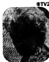
8:30 The Lucy Show Lucy volunteers to help Mr. Mooney's campaign for city controller. But Lucy and politics don't mix . . . as Mr. Mooney finds out!