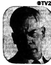
9:30 Lee Marvin A group of criminals attempt to bribe the guard at a large warehouse, but the police are notified.