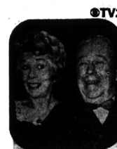
9:30 Petticoat Junction Beatlemania reaches Katz's three girls and they go Beatle Wild . . . so wild that they start their own comb and call themselves The Ladybugs.