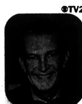
7:30 To Tell The Truth Challenging fun and surprises are in store for you when you join Bud Collyer's fib-spotters tomorrow night.