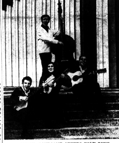
TUNEFUL FOURLING OFFERS FOLK SONG

Twelve Birmingham residents will be singing in the Rackham Symphony Choir when it presents a concert on religious music with the Detroit Symphony Orchestra at 8:30 p.m. Wednesday at the Ford Auditorium.