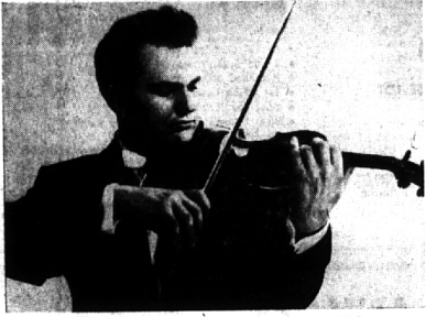
BOLIVIAN VIOLINIST JAIME LAREDO