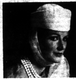
WHITE SILK organza pillbox is wonderful counterpart for any spring suit. For sheer flattery, the attached organza scarf is softly bowed under the chin.