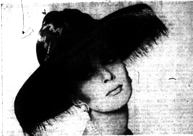
LARGE-BRIMMED "Coolie" hat of silky black haircloth swirls from the gently rounded crown to delicate fringe that beguilingly shadows the eyes . . . from the Hattie Carnegie spring 1964 millinery collection.