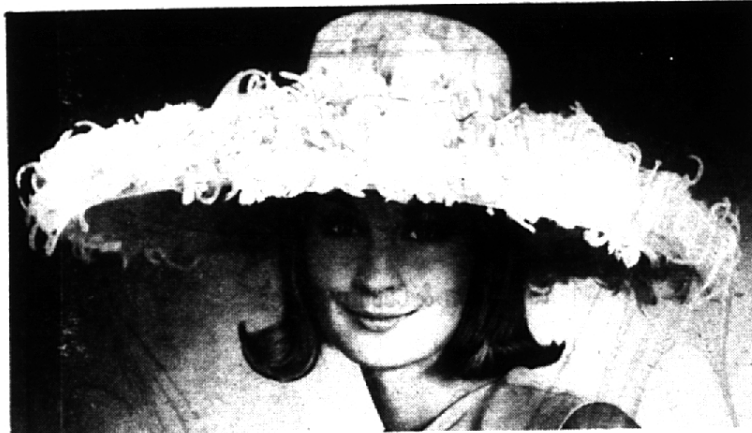
TRULY FEMININE topping to complement summer's sheerest dresses: a cascade of billowy white hyacinths encrusted on one of this season's popular oversized brims.

The usual range of fabrics and colors appears again. Some marvelous light or bright pastel tweeds are around, quite a bit of navy and beige and ordinary pastels. The really big fabric news is in the lightweights: Lots of rayon linen coats, cottons and soufflé wools.