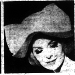
BALIBUNTAL SWEPT UP brim, with yards of draped chiffon ending with a large bow, in "The Sweep" from the Miss Alice spring collection.