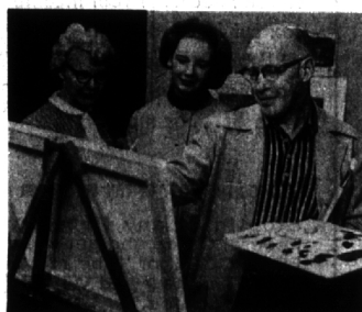
Classes in the creative arts are a regular part of the Community House curriculum.