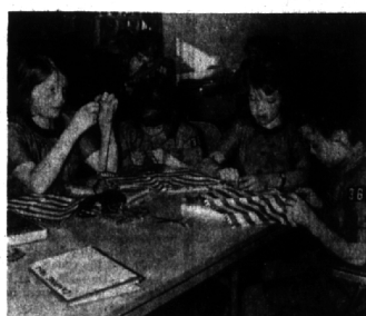
Youth groups, like these "Brownies," use The Community House for many of their activities.