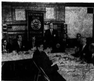
Service clubs find The Community House an ideal place to hold their meetings—and the food's good, too.