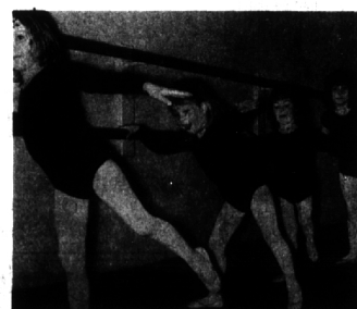
Dancing doesn't come easy to four-year-olds—but The Community House is a good place to start learning.