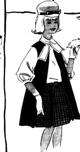
Navy and White: Right Costume Duo! 10 98 complete

Perky pink or blue stripes on easy-care woven cotton sleepwear. Nice to own, perfect for showers and gift-giving. Shift gown has bias binding, twill bows and inverted box pleats from front yoke. Baby doll PJ's are so feminine, with pleated flounce at hem. S-M-L. (Also matching night shirt, not shown). Lingerie—Main Level