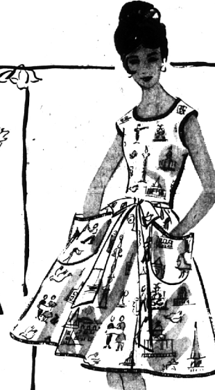
French Print Swirl, Just Wrap 'n Tie 5 98

The daytimer that goes on in seconds, just button, wrap, tie! In a gay French print on white cotton, little or no ironing required. Red or navy binding, sizes 12-20; 14 1/2-24 1/2.