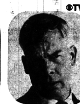
9:30 Lee Marvin