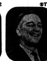
10:30 Garry Moore