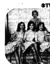
9:30 Pat Boone