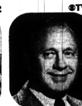
9:30 Jack Benny