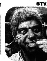
11:30 Morgus Presents

Sach's hard head leads to fame and fortune when Slip discovers that Sach has a miracle power in his head!