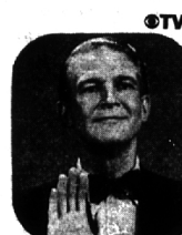
7:30 Tell The Truth