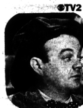
4:30 Bowery Boys