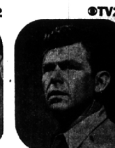
9:30 Andy Griffith

Share the fun and match your wits as Bud Collyer and his panelists try to unmask another array of imposters.