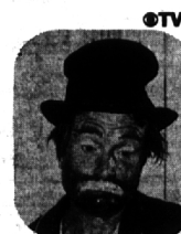
8:30 Red Skelton