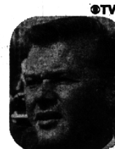
8:30 Route 66