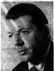
PROF. JOHN CIARDI

Birmingham Town Hall will present Prof. John Ciardi at 11 a.m. Feb. 20 and 21 at the Birmingham Theater. He will answer the question "What Good is a Poem?" Prof. Ciardi is the editor of Saturday Review and host on the CBS-TV network weekly show "Accent." He is a graduate of Tufts College with an honorary degree of doctor of literature and has received many awards for his contributions to the literary world.