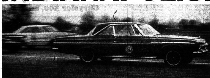
Raceway Park: "Test Track, U.S.A."—Report #2