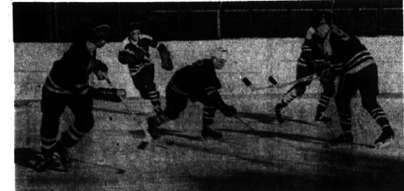
TWO CRANBROOK players wheel and start down ice as opposing Detroit Cathedral skaters (light jerseys) converge on them. Cranbrook scored once in the last period, but

Anyways, remember the name. You'll be hearing a lot of it in speed-skating circles for a while.