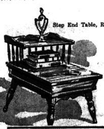
Step End Table, Reg. $67