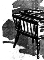
Magazine End Table, Reg. $57