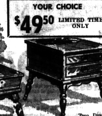
Two Drawer Commode, Reg. $57