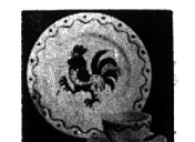
CALIFORNIA PROVINCIAL Rustic Provincial Dinners in antique motif with a Western flavor.