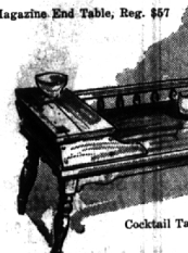
Cocktail Table, Reg. $57