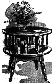
Revolving Drum Table, Reg. $57