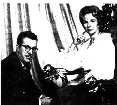
At Home in Royal Oak