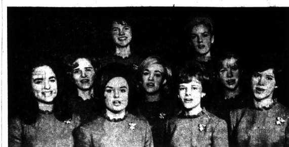
Hills Singers Present Concert

More than 125 choir students participated in the 10th annual Christmas Concert at Bloomfield Hills High School Saturday evening. Titled "The Sound of Christmas," the program featured organ solos, combined choir singing and The Jills, (above) a school singing group.