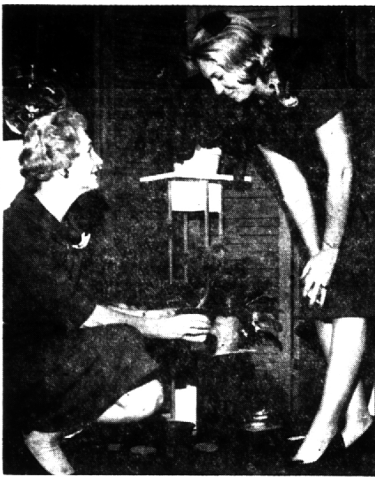
Their Gift to B'ham