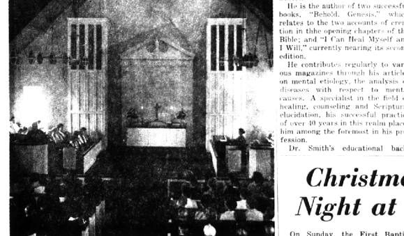
EMBURY'S NEW SANCTUARY Building was consecrated in October.