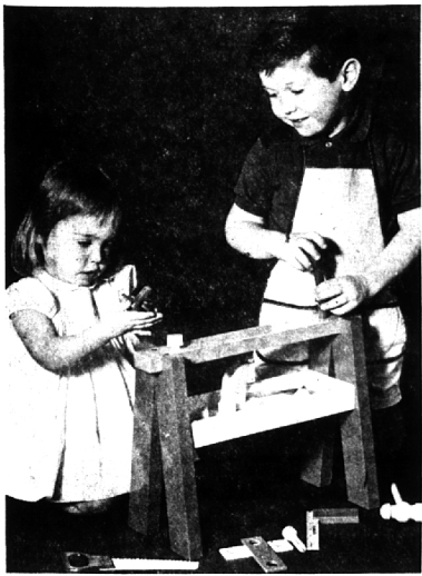
WORKBENCH TOY JUST LIKE DADDY'S Bench top removes to become saw horse with tray.