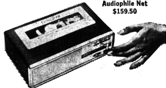
Audiophile Net $159.50