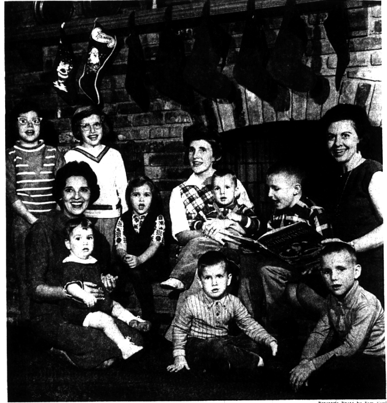
Eccentric