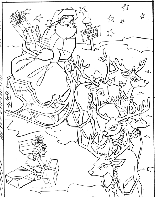
COLOR THIS PICTURE