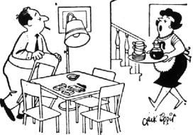
"About 10 o'clock you kick Edith's shin, and I'll kick Fred's. They'll leave early so they can quarrel."