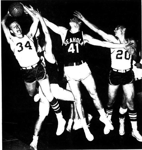
GROVES AND SEAHOLM PLAYERS FIGHT FOR LOOSE BALL. Scuffle occurred in intra-city battle won by Seaholm, 82-62.