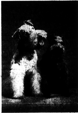
"SOMEONE LOVES YOU, TOO!"