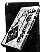
Aggravation 2-4 Players 137

Manipulate parts to pop "sleepy head" from bed!