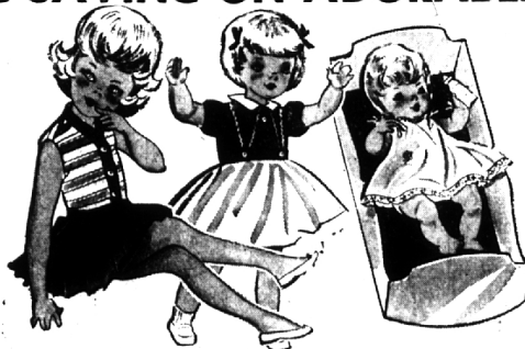
NEW POS 'N' PEPPER® DOLL

Soft 15" long-pile plushy dogs. White, beige . . . black ears.