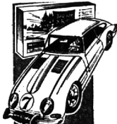
XKE Jaguar Sportscar 779

Young engineers will have hours of fun with this battery-operated locomotive. 13" long . . . green metal with red trim. *Batteries extra