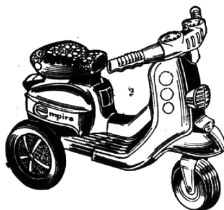
RIDE 'EM SCOOTER Great for Little Cyclists! Toy Discount Spectacular 297

Makes bikes roar! Plastic, 8" x 3½". Use 2 "D" batteries. *Batteries extra