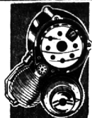
Za-Za Zoom Motor Unit 297*

21½" polyethylene dump truck comes with battery-operated "ZA-ZA Zoom" motor for realistic sound. Two separate controls. *Batteries extra