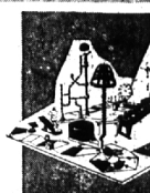
MOUSETRAP Reg. 4.88! 396