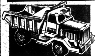
ZA-ZA ZOOM TRUCK! Battery Operated Sound Motor Toy Discount Spectacular 677*

21½" polyethylene dump truck comes with battery-operated "ZA-ZA Zoom" motor for realistic sound. Two separate controls. *Batteries extra