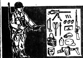
"STONY" THE FIGHTING G. I., WITH EQUIPMENT