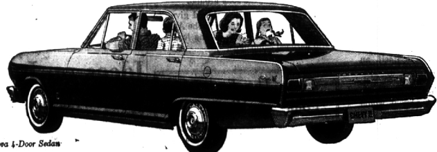
'65 Chevy II Nova 4-Door Sedan

'65 Chevelle Malibu Here's all that made Chevelle America's most popular new-size car—plus some new surprises. Like the silky way its new ride skims over the choppiest roads. Like V8 power that'll make you think we stole some of Corvette's stuff—which we did. All told, six engines are available from a quieter six to a V8 that comes on 350 horses strong.