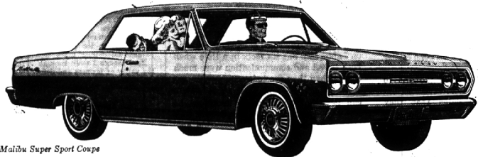
'65 Chevelle Malibu Super Sport Coupe

'65 Chevrolet Impala It's longer, lower, wider—with comforts that'll have many an expensive car wondering why it didn't think of them first. More shoulder room, more leg room up front. Curved side windows. In fact, just about everything's new right down to the road. And even that'll seem never because the Jet-smooth ride is smoother than ever.