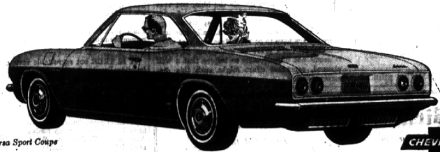
New Corvair Corsa Sport Coupe

'65 Chevy II Nova It may be the expensive-est looking thrift car you've laid eyes on. But thrifty it is. The big difference being that Chevy II's marvelous mechanical efficiency now wears a debonaire new look. And offers a new range of engines, including a new 300-hp V8. Ready for a go at the liveliest thing that ever happened to thrift? The Chevy II's are rolling in.