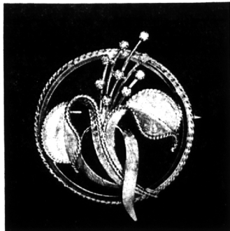
18KT brooch with a spray of 9 full cut diamonds 475.00