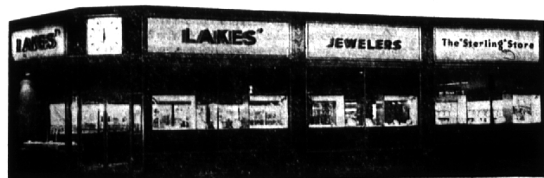
woodward at maple

★ Lakes Jewelers of Birmingham will be closed December 26 to give our employees a much needed "long weekend." Our exchange privileges will be extended 3 days for your convenience.