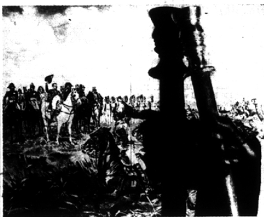
SWORD CASTS SHADOW OF NAPOLEON'S PROFILE Replica of one carried by his followers