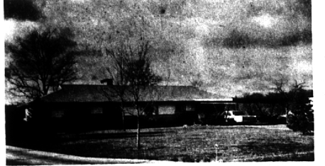
How big is your family? 5 bedroom Bi Level Ranch with family room and game room, sited on a hill. A home bursting to be lived in—First time offered—Be the first to see it. $36,900.