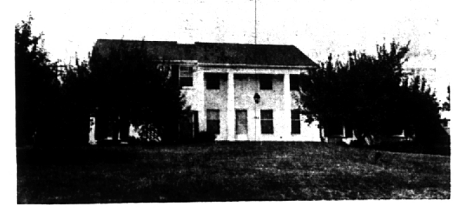
WORK'S ALL DONE —This 3 year old Southern Colonial is complete with carpets, drapes, and landscaping and is unusual in its fine detailing. FOUR excellent bedrooms, superb family room with massive beamed ceiling, large formal dining room, 2½ baths, and 2 fireplaces. MOVE RIGHT IN! $49,000.