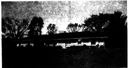
A delightfully secluded setting with a stream crossing the property in the rear. In City of Bloomfield Hills on a cul-de-sac. Superbly built and interestingly arranged. Exceptionally large rooms throughout, including separate dining room, many windowed family room, outstanding kitchen, three bedrooms and 2½ baths (the master bath is 15x10). You'll enjoy its privacy and convenience.