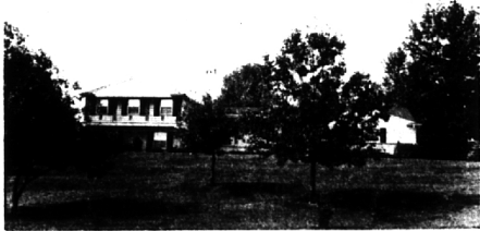
LUXURY LIFE —Set on a beautifully landscaped hillside site, this Colonial tri-level even has a heated swimming pool. FOUR big bedrooms, 3 full baths plus lav., superb beamed ceiling family room with hidden bar and copper hood fireplace, full basement, and att. 2 car garage. COMPLETE IN EVERY DETAIL! $67,500.