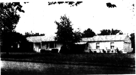
WING LAKE —Unusually appealing traditional ranch on a double corner lot and just a short walk from the beach on Wing Lake for year 'round fun. 3 nice bedrooms, delightful summer room with fireplace (can be easily heated for permanent use), cheery kitchen, 1½ baths, and att. 2 car garage. CALL AND SEE! $25,750.