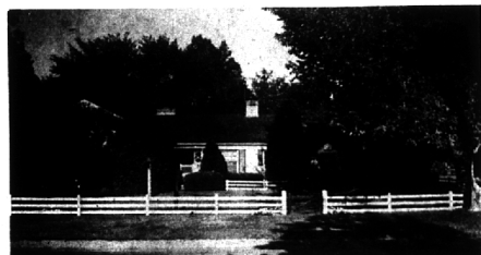
A charming Colonial ranch on a superbly landscaped site in Foxcroft shaded by towering trees. An interesting plan with both a library (or guest room) and a large paneled family room. Three twin size bedrooms, 2 baths, well organized kitchen, separate dining room, finished rec room with bar-sink, 2 car garage with door opener. $33,900.