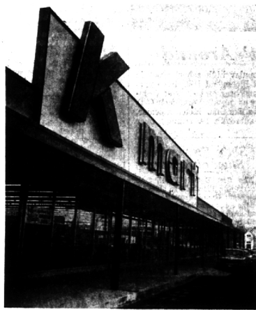
TROY K-MART READY FOR OPENING. Parking for 1,000 cars.