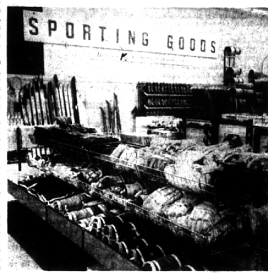
40 DEPARTMENTS ON ONE FLOOR. Over 35,000 items for sale.

Troy city officials and top executives from the Kresge Co. will be on hand next Thursday for the ribbon cutting opening of the new K-mart store at Maple and Main streets. The doors of the new store will open at 10 a.m. following the brief official ceremony. The new K-mart will have 40 departments on one floor spread over an area as big as 632 average living rooms. Merchandise includes everything from TV sets and furniture to clothing for men, women and children as well as sporting goods. In all, the store will feature 35,000 items for sale. • Enough flooring tiles to floor ten foot by ten foot kitchens for almost 1,500 homes. • Enough concrete to make a sidewalk four feet wide three inches deep and 125 miles long. • Use enough air-conditioning in any one year to keep 75 good sized homes at 60 degrees all year long. • Use enough electricity to keep 1,000 homes lighted for a year. • Use enough gas to heat 800 homes for a year. THE TROY store is one of 32 new K-marts being opened this year by the Kresge Co. At the beginning of 1964 Kresge's operated 63 K-marts. Plans for expansion in the K-mart field were prompted by consumer acceptance of the first few outlets opened two years ago.