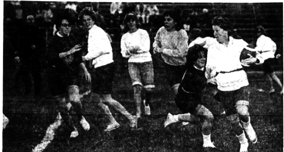
FALCON GIRLS DISPLAYED PROWESS ON GRIDIRON Groves' annual Powder-Puff game was won by juniors, 21-13.