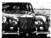
New Rolls-Royce Silver Cloud III during series of tests.

Quiet Means Quality ... Since quiet is a traditional measure of car quality, Ford engineers designed the '65 Ford for maximum quietness. To illustrate