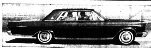
The Total Performance 1965 Ford Galaxie 500 LTD being tested.

TEST CONDITIONS: Dry, level, moderately smooth concrete divided highway, light, quartering wind. All cars operated at steady 20, 40 and 60 mph with all windows and seats closed. TEST EQUIPMENT: Bruel & Kjaer precision octave band analyzer, recording through direct observation and through Nagra precision tape recorder. Data expressed in Perceived Noise decibels. TEST CONDUCTED ON September 24, 1964, by Bolt, Beranek and Newman, Inc., of Cambridge, Mass., the world's largest acoustic consulting firm. TEST CERTIFIED by the United States Auto Club. CARS TESTED: Two brand-new Rolls-Royce Silver Cloud III sedans, V-8 with automatic transmission, list price in New York $16,655 each. Three 1965 Fords, each with 289-cubic-inch V-8 engine and Cruise-O-Matic transmission: Galaxie 500 LTD, Galaxie 500, Galaxie 500 4-Door Sedan.