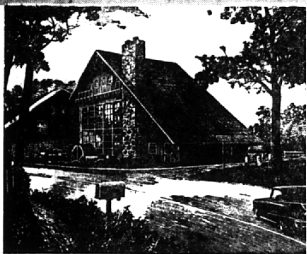
Visit Our Exhibition of Early Americana