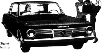
Valiant Signet 2-door Hardtop

Belvedere is another complete line of 1965 Plymouths. What distinguishes the Belvedere is its family size, its sensational performance, and its low price. It's the new way to swing without going out on a limb.