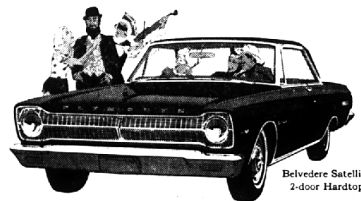
Belvedere Satellite 2-door Hardtop

Fury is the leader of the 1965 Plymouths. You never saw a Plymouth like it before. It is the biggest, plushiest Plymouth ever. But still solidly in the low-priced field. In the Plymouth tradition, Fury is a great performer — a car named for its hustle.