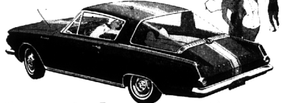
Barracuda 2-door Sports Hardtop

Valiant is another complete line of 1965 Plymouths. It's the compact Plymouth that hasn't forgotten gas economy, ease of handling and parking. And for 1965, the best all-around compact comes all wrapped up in a bright new package.