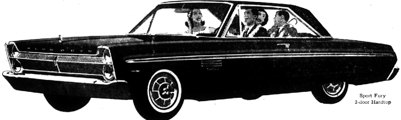
Sport Fury 2-door Hardtop