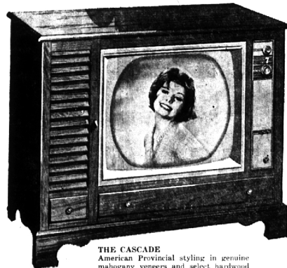
THE CASCADE American Provincial styling in genuine mahogany veneers and select hardwood solids.

Genuine HANDCRAFTED for WORLD'S FINEST PERFORMANCE