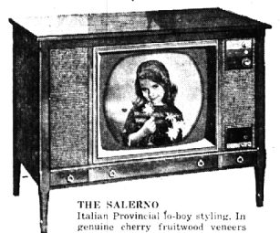
THE SALERNO Italian Provincial fo-boy styling. In genuine cherry fruitwood veneers and select hardwood solids.