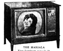
THE MARSALA Fine furniture outside in cherry fruitwood veneers and select hardwood solids.