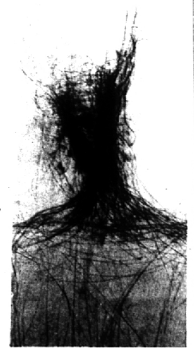
DRAWING 'MADONNA' By George Vihos