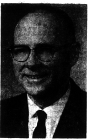
College Names Dean