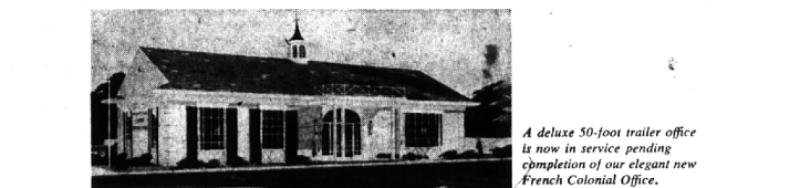
A deluxe 50-foot trailer office is now in service pending completion of our elegant new French Colonial Office.