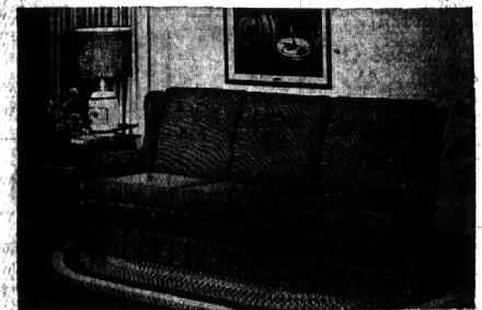
HI-BACK 86" SOFA

Generously sized 86" sofa to provide loads of rubber cushions and finest quality construction.