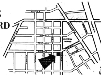
THIS IS OUR NEW LOCATION . . . 115 W. BROWN STREET (SW Corner of Brown & Pierce)

IT'S WITH GREAT PLEASURE WE ANNOUNCE THE OPENING OF OUR NEW HOME and LOOK FORWARD TO SHOWING THESE NEW FACILITIES TO YOU