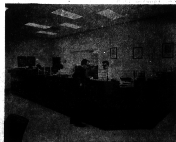
Direct wire contact with Goodbody's New York office and with New York and other Exchanges provides important customer services, assuring the utmost in speed and accuracy.