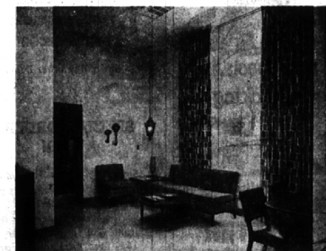
Comfortable commodious area adjacent to the cashier's office facilitates concluding buy and sell transactions.