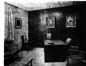
Conference areas assure pleasant solitude and privacy in transacting important personal financial matters.