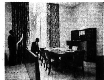
Quiet library atmosphere is provided for customer analysis of detailed industrial facts so important in proper security selection.