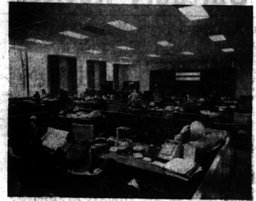
Commodious facilities afford complete customer comfort in security transactions in person or by telephone.