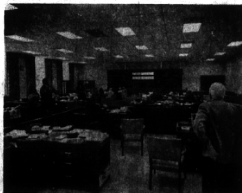
Modern facilities provide unobstructed visibility and quick, accurate price and trend information.