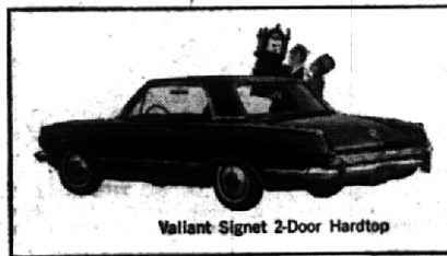
Valiant Signet 2-Door Hardtop

'64 Plymouth and Valiant shift into high...with the year's sportiest new cars. Soft-tops, hardtops...bucket seats...four-on-the-floor sticks...engines that go all the way up.