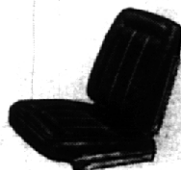
All-Vinyl Bucket Seats

VALIANT/'64 STYLE—BEST ALL-AROUND COMPACT —One look will tell you that Valiant, again in '64, is the best all-around compact. Best in all-around performance. Best when you consider how little you pay for it and how much it will bring when you trade it. Best almost any way you look at it. Valiant/'64 style—sporty—spunky—something special in compacts with its 5-year/50,000-mile engine and drive train warranty.* See it at the Auto Show. Drive it at your Plymouth-Valiant Dealer's.