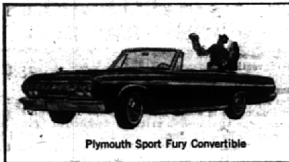
Plymouth Sport Fury Convertible