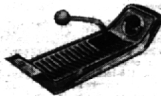
Console-Mounted 4-Speed Shift (Optional)

Get up and go Plymouth! —If you'd like a car that puts enthusiasm back into car ownership, '64 Plymouth is for you! With new style, inside and out, that makes owners proud and neighbors envious. With standard or optional engines designed to deliver real "get-up-and-go" performance. With quality typified by Plymouth's 5-year/50,000-mile engine and drive train warranty.* "Tops up" or "tops down," you go in style with Plymouth. See it at the Auto Show, and drive it at your Plymouth Dealer's.