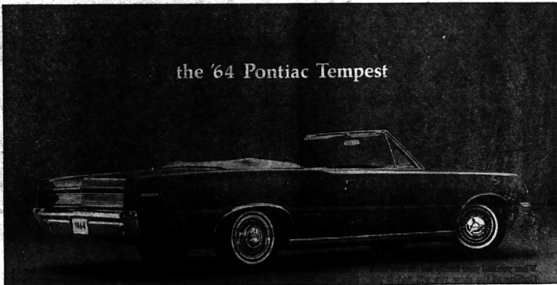
the '64 Pontiac Tempest