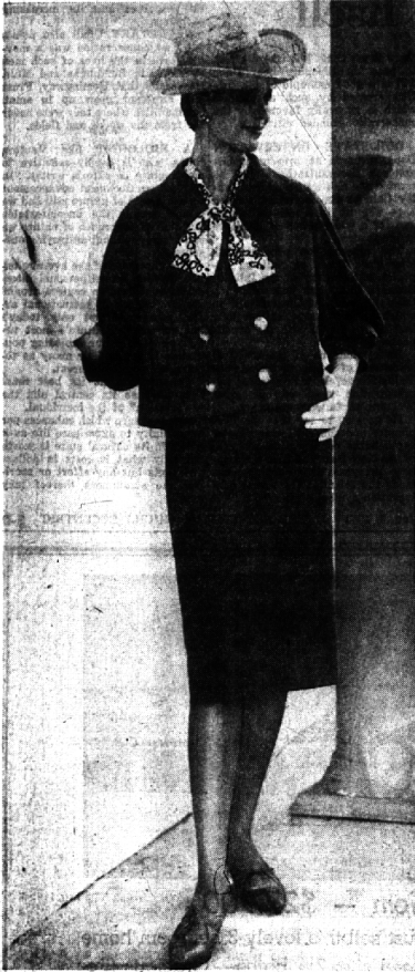
Adele of California's PLATINUM WOOL SUIT

Capes are highly important in line, and the predominant colors are roseate, sage, seafoam and "bond" camels hair.