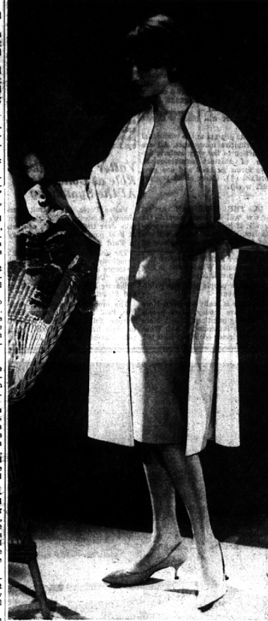
Oscar of Beverly Hills' EASY FLUID COSTUME