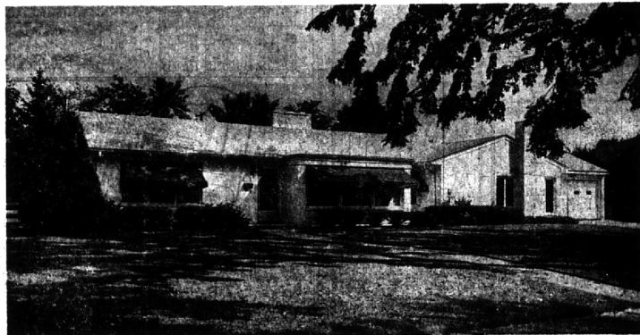
On Pilgrim In Quarton Lake Estates Family Room — $31,000

Gracious Colonial Ranch situated on high 207 ft. beautifully landscaped corner lot. 3 bedrooms, 2 full baths. Separate dining room, paneled library, and large cheery kitchen with table space makes this home a wonderful "buy" for your family. Carpeting and draperies throughout—2½ car garage. Vacant and immediate possession.