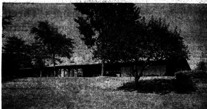
View of A Life Time 5 Beautiful "Bloomfield" Acres

NATIONAL LEGION OF DECENCY A1 Morally Unobjectionable for General Patronage A2 Morally Unobjectionable for Adults and Adolescents A3 Morally Unobjectionable for Adults B Morally Objectionable in Part for All C Condemned SC A separate classification is given to certain films which, while not morally offensive in themselves, require some analysis and explanation as a protection to the uninformed against wrong interpretations and false conclusions.