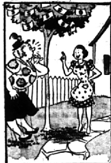
"He's going to have to think up another answer the next time I ask him for money for a new hat!"