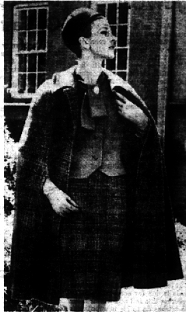
Shaped Chesterfield coat (left) with high front line, self-fabric frogs and the important new Edwardian sleeve, set high. In ox-ford gray with front facing of the lighter banker's grey. At right, for the fall 1963 flair—Davidow's cape costume of olive plaid imported wool with a vest-like blouse of olive wool jersey.